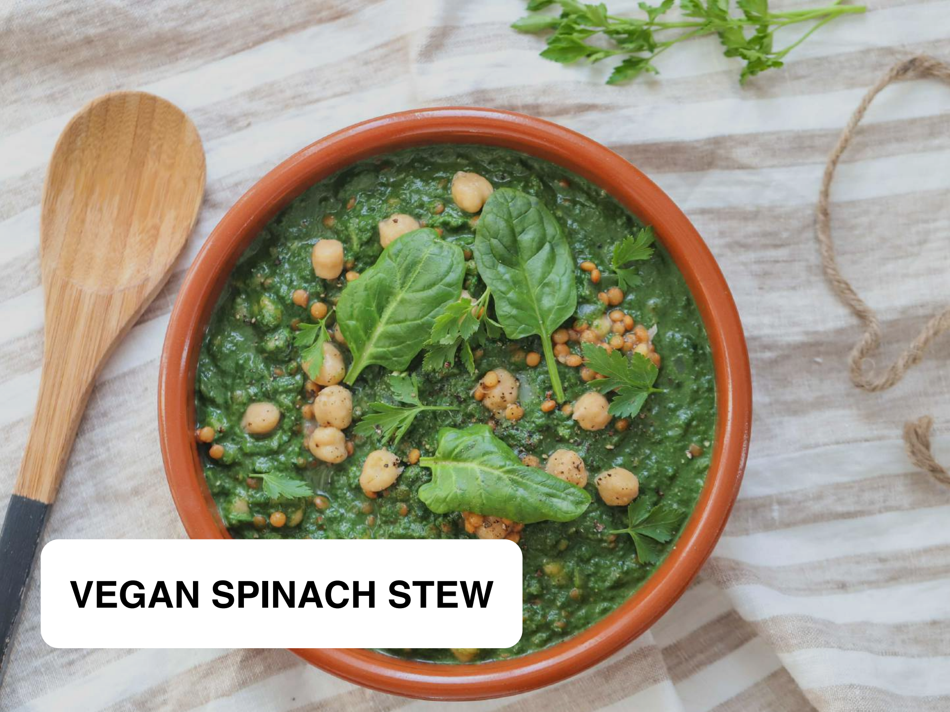
VEGAN SPINACH STEW