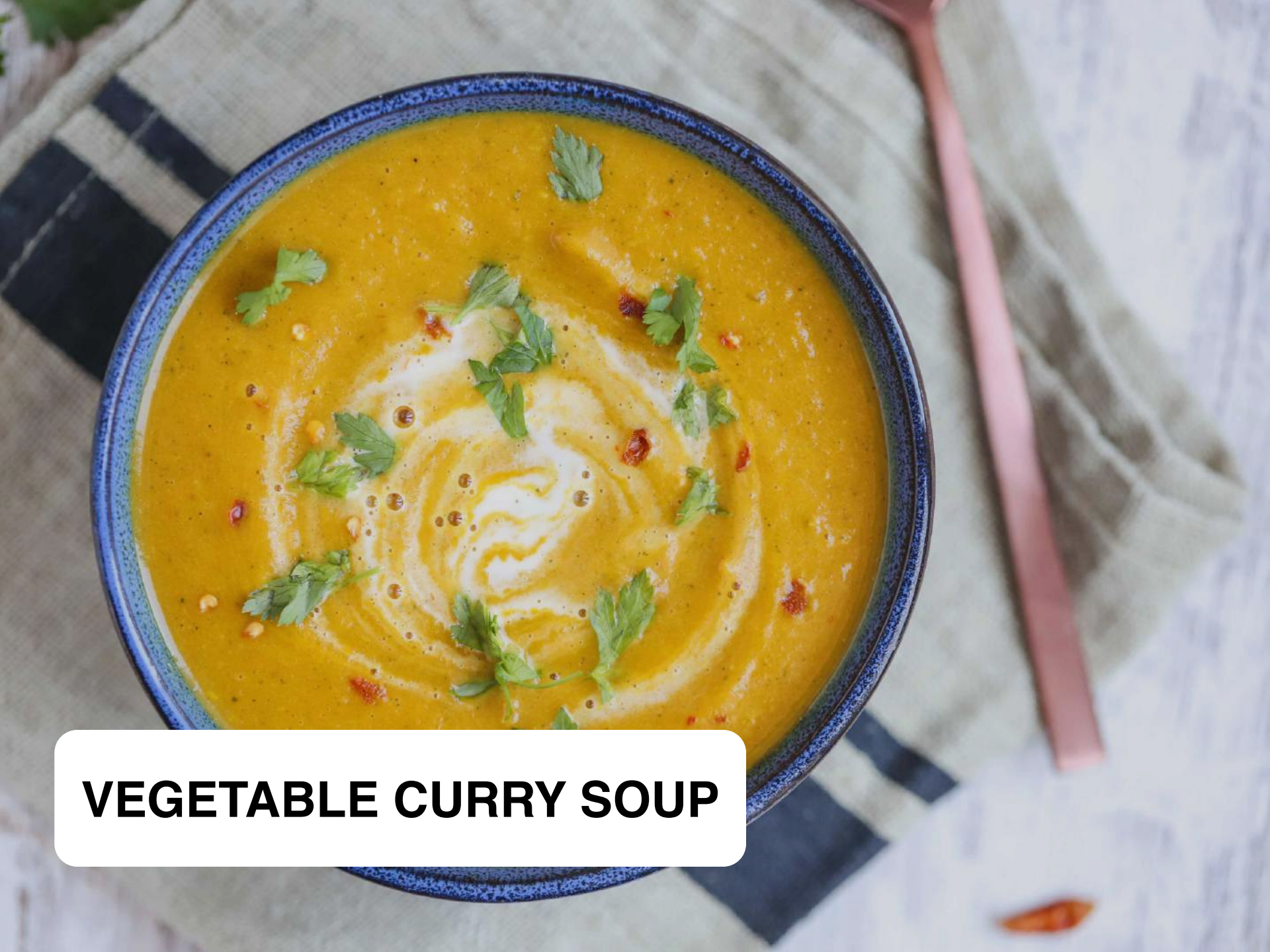
VEGETABLE CURRY SOUP